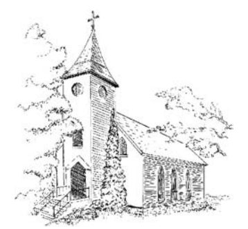
St. Mary of the Rosary, Hepworth Sunday 9:00 am (Nov-Mar)

Email: smm@bmts.com www.stmarysandthemissions.ca